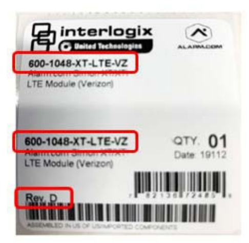
Figure 1: Interlogix model and revision level

1. To find the Interlogix model and revision level, look for the Interlogix fold-over label on the box. The model number will be printed in two locations and the revision code will appear above the last barcode.