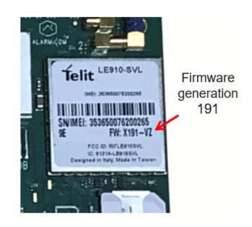
Figure 3: Exact modem firmware version

a. Simon XT: From the home screen, use the down arrow to navigate to System Programming. Continue to navigate according the following sequence.