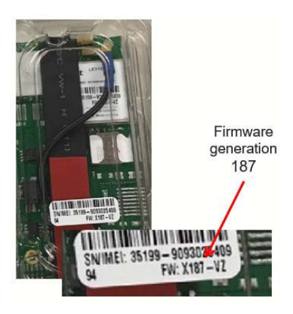
Figure 2: Modem firmware (FW)

3. To find the exact modem firmware version, you can install the modem in a Simon panel and use the Interactive Services menu in System Programming to check the Module status. Below are screen shots showing how to find the module firmware version on the Simon XT and the Simon XTi-5i.