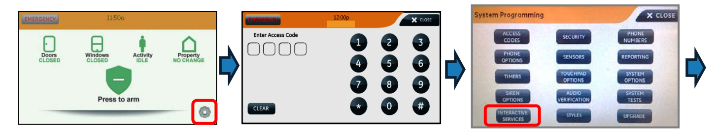
Figure 5: Module information

b. Simon XTi-5 / XTi-5i: From the home screen, use the configuration icon to navigate from System Programming and Internactive Services to find the Alarm.com module information, per the below example. This will be available in the 4-3-2-1 menu. In this example, the firmware level is 189j.