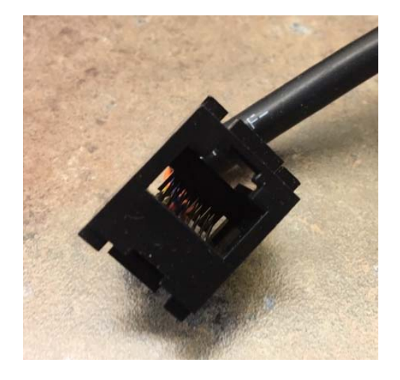
Figure 6: RJ-45 jack for use with an internet cable

The latest Simon modem offerings include two dual-path models, identified by the "...DP-2" in the suffix. These allow not only for cellular communication, but also for Internet Protocol connections, if available. The chosen path for communications will be determined by Alarm.com, depending on a number of factors including availability and rates. The modem kit includes the required antennae and also a dongle with an RJ-45 jack for use with an internet cable, as seen below.