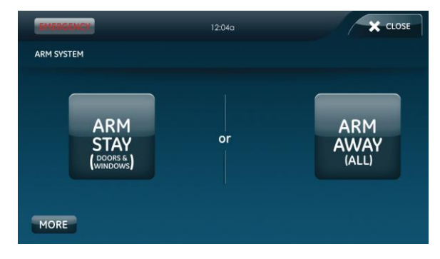
Figure 2: Arming Screen

Note: Depending on configuration by your security provider, your ARM screen may have three buttons displayed instead of two.