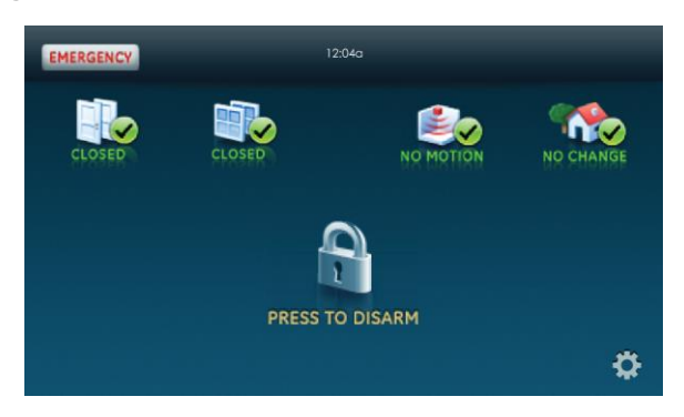
Figure 1: Main Screen

The look and color of the Main Screen may vary depending up on the configuration by your security provider. The location of the buttons, controls, and icons are the same as shown in this manual. Colors and icon styles may differ to match those of the service provider's mobile application. For any questions contact your security provider.