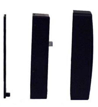
Figure 2. Base plate, reader case, and top cover

Interlogix 3211 Progress Drive, Lincolnton, NC 28092, USA