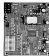
Model 4115 Serial Zone Expander