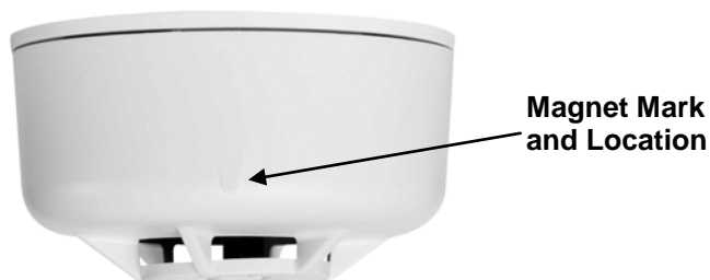
Figure 4: Magnet Mark

Note: Notify central station before any live testing to avoid fire response. The magnet test allows the sensor to send an actual alarm signal to the control panel, if a magnet is held against the housing for 15 seconds.