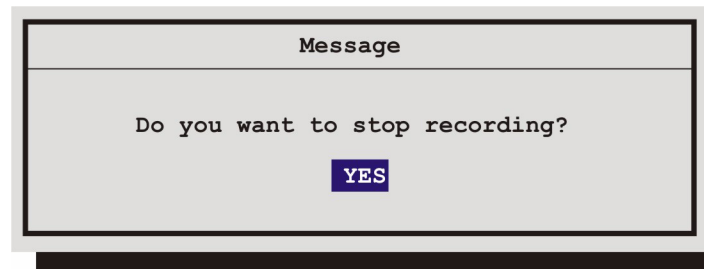
Figure 1. Example of a user confirmation window

Note: When User Confirm Disable is selected you will not see any user confirmation windows of any kind.