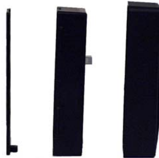
Figure 2. Base plate, reader case, and top cover

Interlogix 3211 Progress Drive, Lincolnton, NC 28092, USA