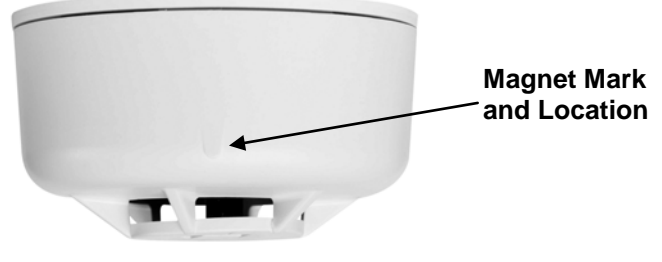
Figure 4: Magnet Mark

Note: Notify central station before any live testing to avoid fire response. The magnet test allows the sensor to send an actual alarm signal to the control panel, if a magnet is held against the housing for 15 seconds.