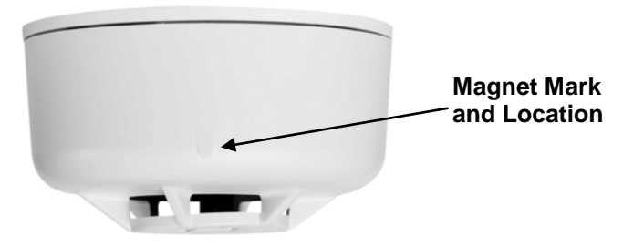
Figure 4: Magnet Mark

Note: Notify central station before any live testing to avoid fire response. The magnet test allows the sensor to send an actual alarm signal to the control panel, if a magnet is held against the housing for 15 seconds.