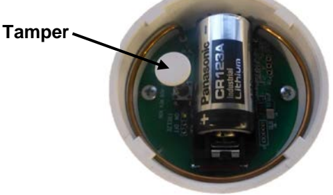
Figure 2: Tamper