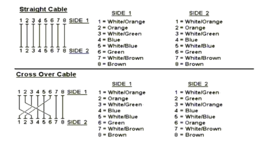
Figure A-1: Straight-Through and Crossover Cable

There are 8 wires on a standard UTP/STP cable and each wire is color-coded. The following shows the pin allocation and color of a straight cable and crossover cable connection: