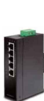
GE-DSGH-5 5-Port Industrial Gigabit Ethernet Unmanaged Switch (-40~75°C)