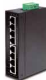
GE-DSG-8 8-Port Industrial Gigabit Ethernet Unmanaged Switch (-10~60°C)