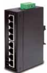
GE-DSGH-8 8-Port Industrial Gigabit Ethernet Unmanaged Switch (-40~75°C)