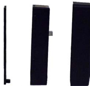
Figure 2. Aligning top cover, reader case, and base plate.