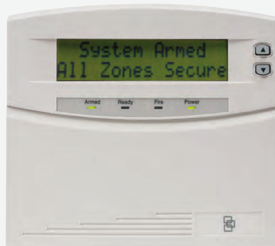
NX-148E & NX-148E-RF