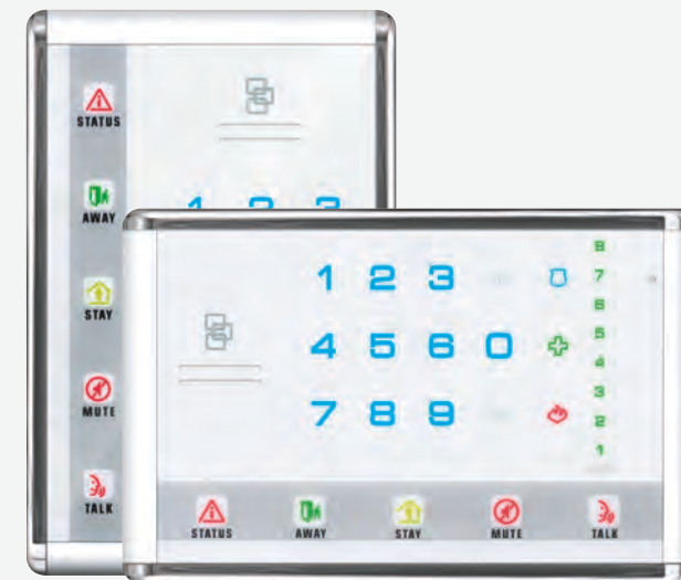
NX-1811E & NX-1813E